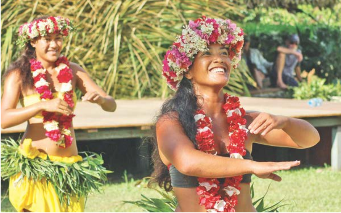
Still today, French Polynesians revere their centuries-old traditions.

This message confirms that you are officially registered with the 2023 Pacific Puddle Jump. So welcome to the fleet!