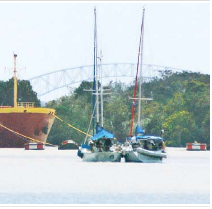
Rafted up after transiting the Miraflores Locks, two cruisers head west toward the Bridge of the Americas and the Pacific beyond.

ruled out a full circumnavigation, but really, we just want to live aboard in warm areas." Knowing how cold it can get in central Germany, where they're from, we can understand why that would be a high priority.