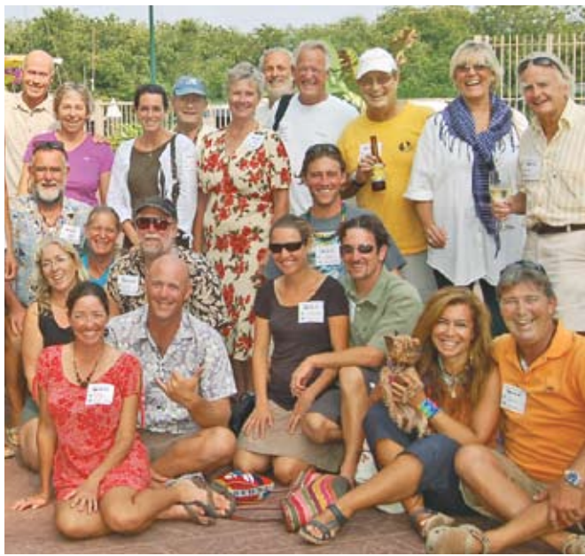
Excited Puddle Jumpers gathered at Vallarta YC last month — our generous host for 15 years.

jects into a kid's personal motivations."