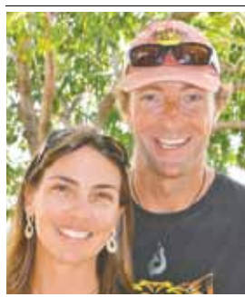
'Wairua' is NZ bound.