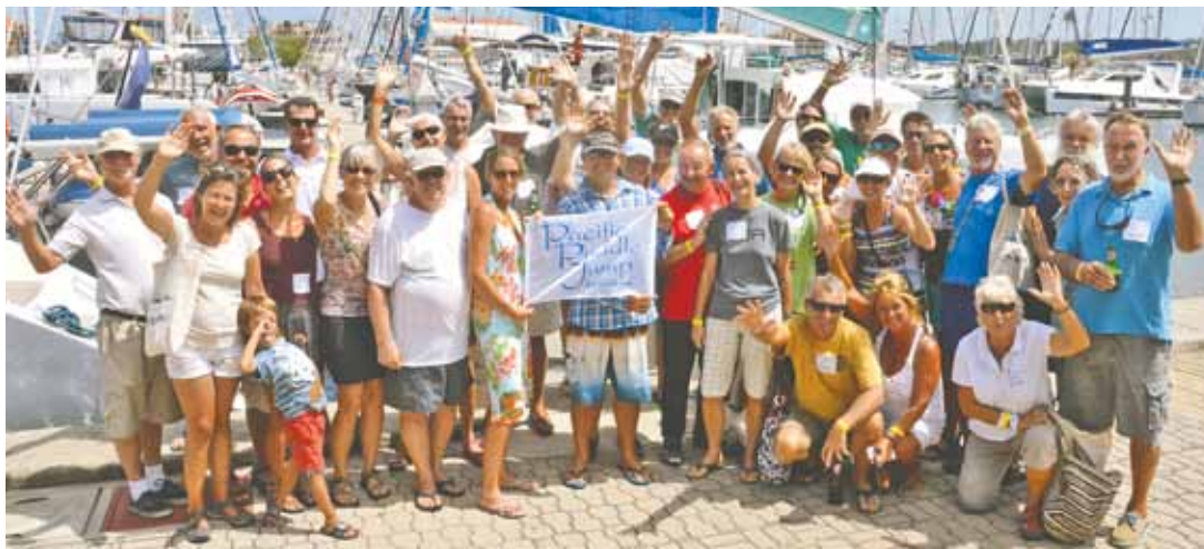
Our PPJ party at Shelter Bay Marina was a huge success, with boats from many nations.

vacationed in Tahiti 40 years ago, he's anxious to get back there for a second look. Afterward, he hopes to reach his New Zealand homeport by Christmas.