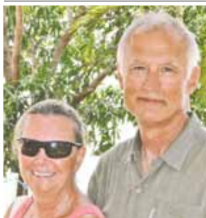
'Il Sogno' is westbound.