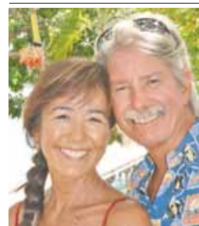
Hawaiians on 'Maluhia'.