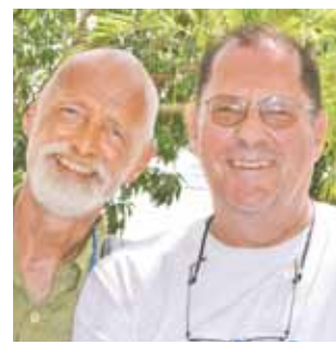
Buddies aboard 'Antara'.