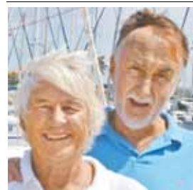
Aussies on 'Fanny Fisher'.