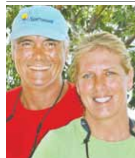
'Continuum' to the rescue.

The decision to follow their lead proved to be truly serendipitous, because about 3/4