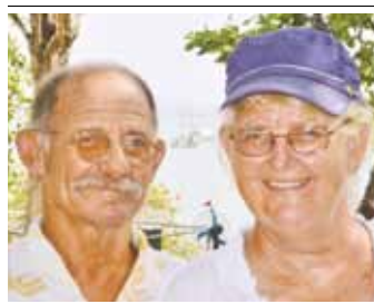
The ambling 'Ambler' crew.

They bought Oceanna sight-unseen, and when they arrived in North Carolina to inspect their purchase they found her in pretty rough shape. But after five months of hard work, they had her back in seaworthy condition again. And after "loading up with spearguns and surfboards," they took off last April on the big adventure.