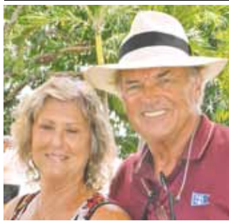
This crew is 'Nauti Nauti'.