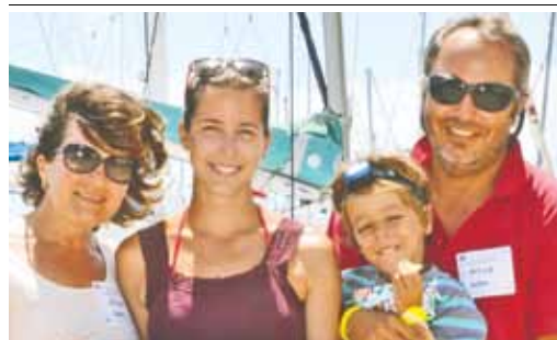
Being landlocked didn't stop the 'Dora' crew.

It's rare enough to find a sailing family who comes from a landlocked country such as Hungary, but the Horvaths actually built their own boat over a seven-year period — out of aluminum, no less.