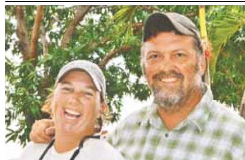
The 'Palarran' pals.