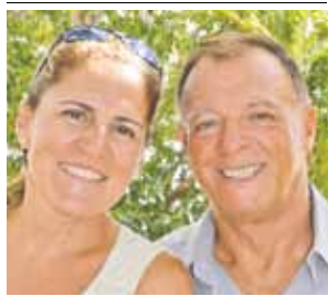
The 'Joalea' crew.