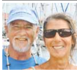
Texans on 'Ocean Star'.