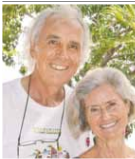
Canadians on 'Cattiva'.