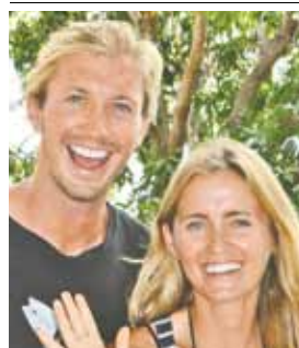
Surf's up on 'Oceanna'.