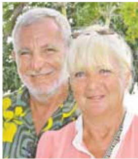
The 'Guinevere I' crew.

"If things go as planned," say Ben and Marian, "we'll probably go to French Polynesia, then up to the Line Islands