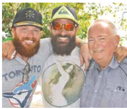
The 'Orient' crew is on the home stretch.

It's not that he doesn't enjoy traveling partners, though. As he explains, "My girlfriend doesn't like sailing. She likes British Airlines tickets to visit me wherever I go." Yeah, he's a retired pilot.